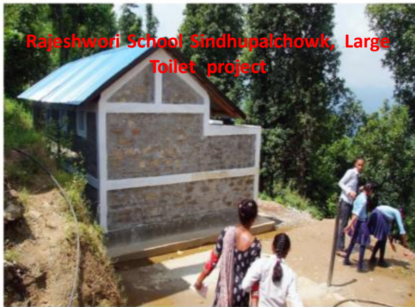
Rajeshwori School Sindhupalchowk, Large Toilet project