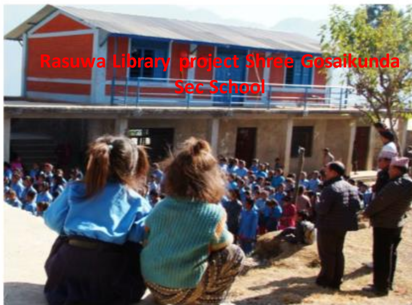
Rasuwa Library project Shree Gosaikunda Sec School